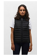
SOL'S STREAM BW WOMEN 04021