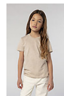
SOL'S CRUSADER KIDS