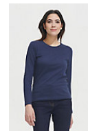
SOL'S Imperial LSL WOMEN 02075