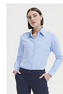
SOL'S EMBASSY 16020