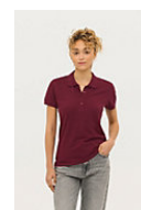
SOL'S PASSION 11338