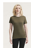
SOL'S REGENT WOMEN