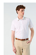
SOL'S BROADWAY 17030