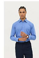
SOL'S BALTIMORE 16040