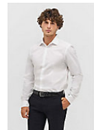
SOL'S BAILEY MEN 04770